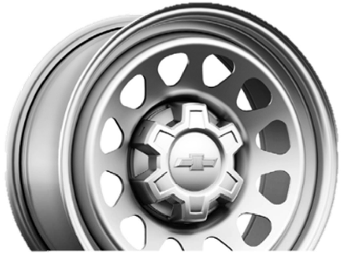
17" Ultra Silver-Painted Steel Standard