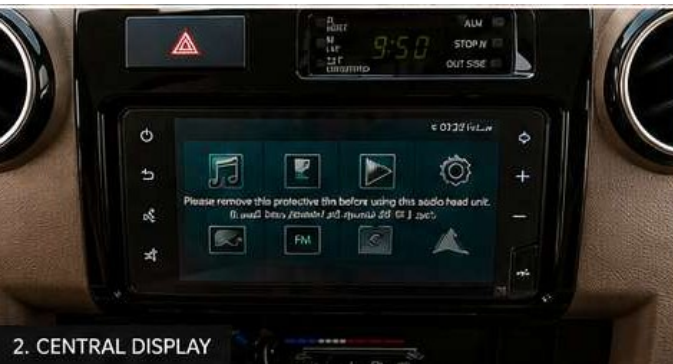
2. CENTRAL DISPLAY