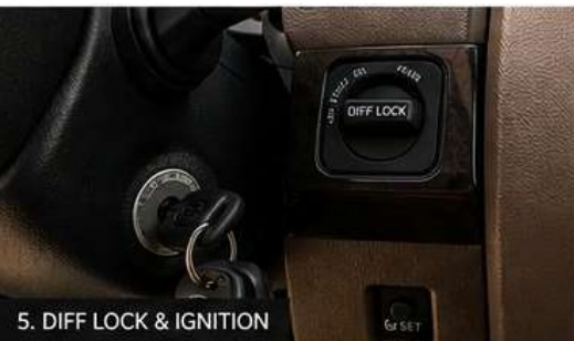
5. DIFF LOCK & IGNITION