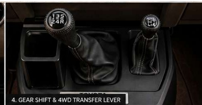
4. GEAR SHIFT & 4WD TRANSFER LEVER