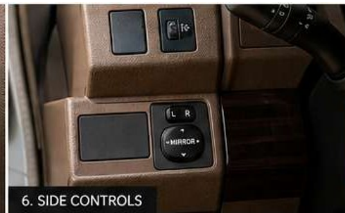
6. SIDE CONTROLS