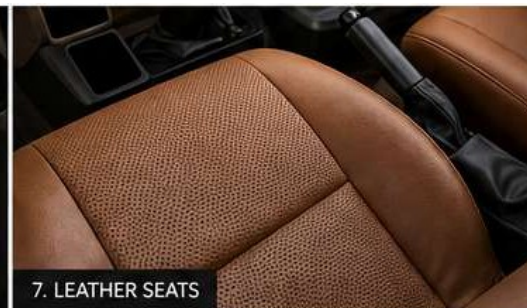
7. LEATHER SEATS