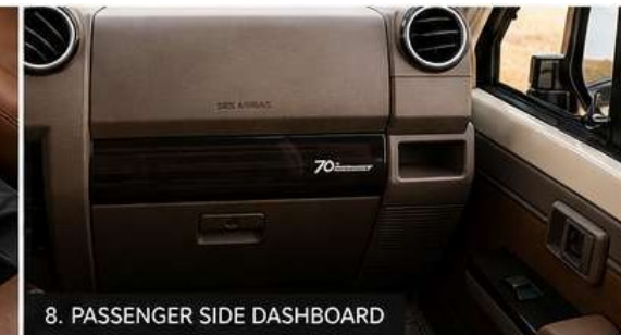
8. PASSENGER SIDE DASHBOARD