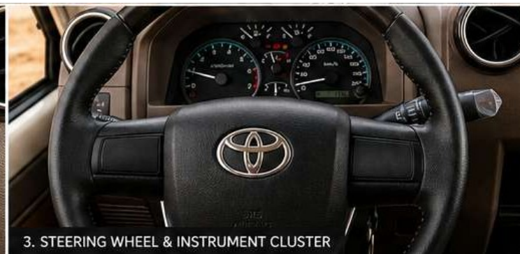
3. STEERING WHEEL & INSTRUMENT CLUSTER